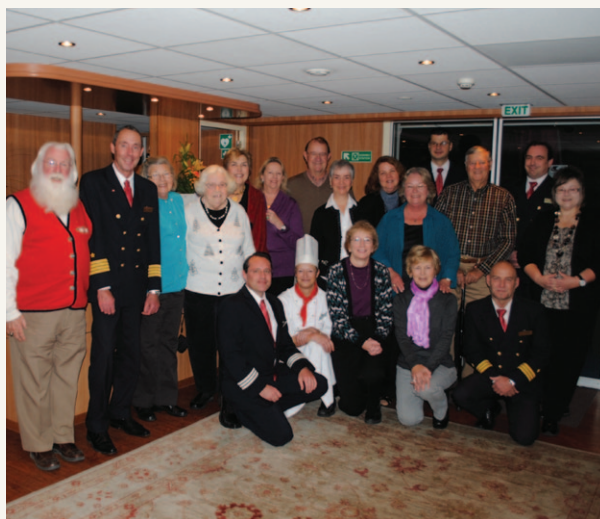
The 20 th Anniversary Golden Advantage trip was fun and full of surprises for everyone, including an extra night in Vienna, Austria! Here the Captain and senior officers of the M/V Thomas Fontane joined us for a Kodak moment.